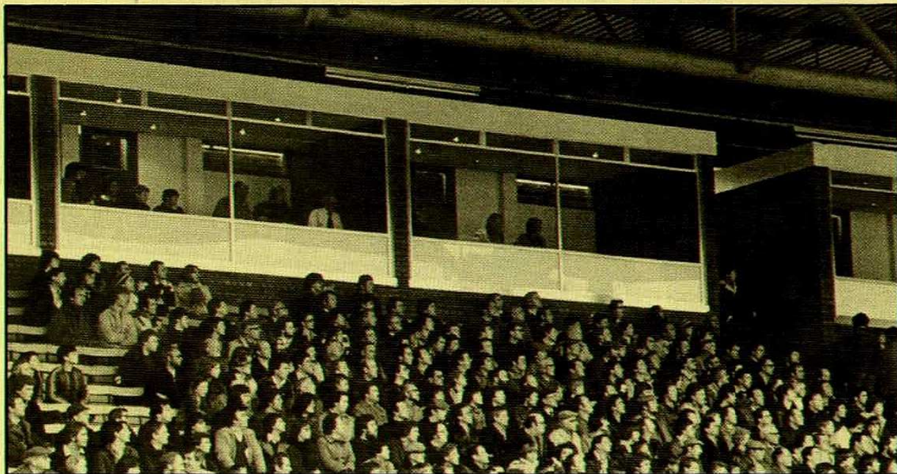
SPECTATOR BOXES – ready for occupation. Call Steve Norton for full details and a viewing.