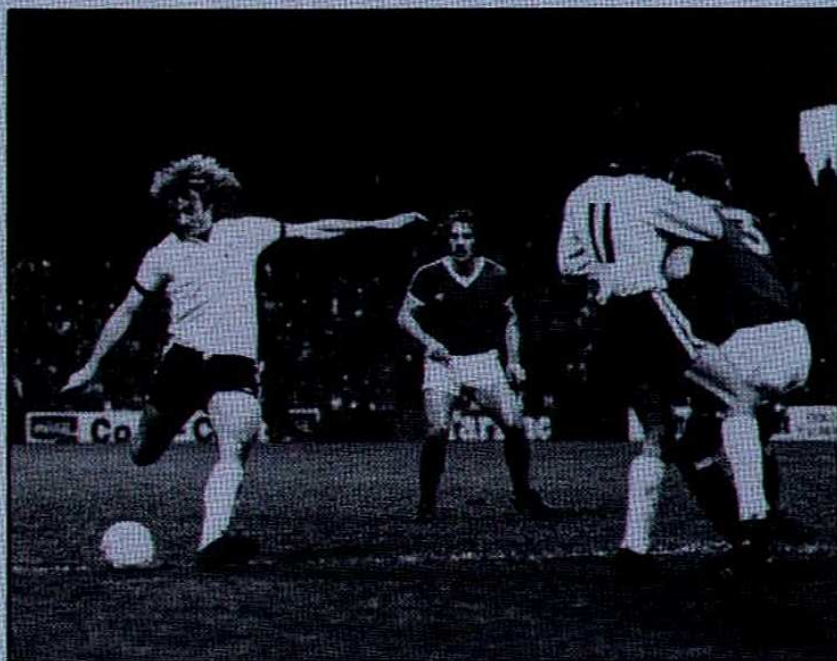
Rodney Marsh scores in the Cup against Swindon in January, 1977.